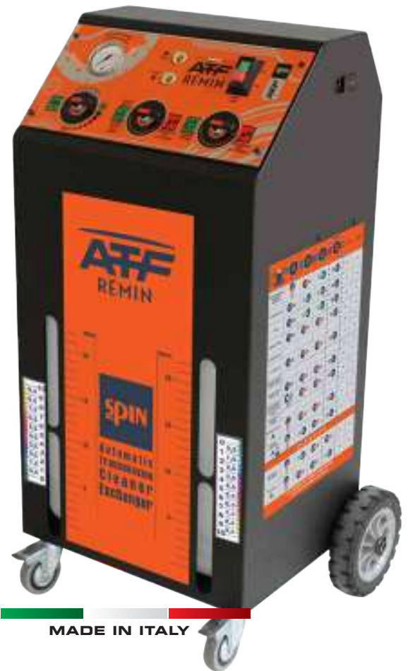
ATF RÈMIN SW Cod. 02.023.57