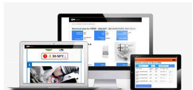
Online Data Base