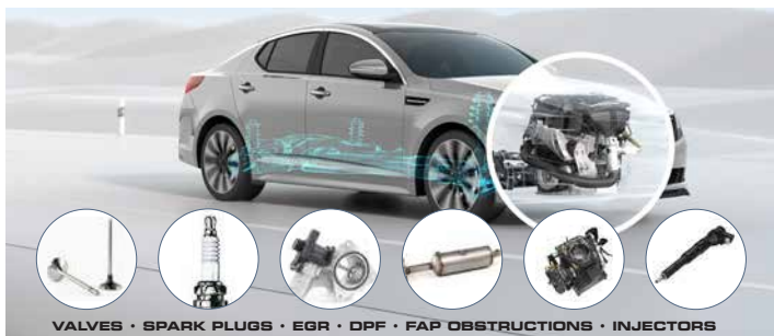
VALVES · SPARK PLUGS · EGR · DPF · FAP OBSTRUCTIONS · INJECTORS